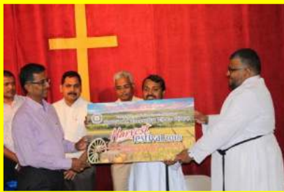
Harvest Festival 2018 Coupon Releasing