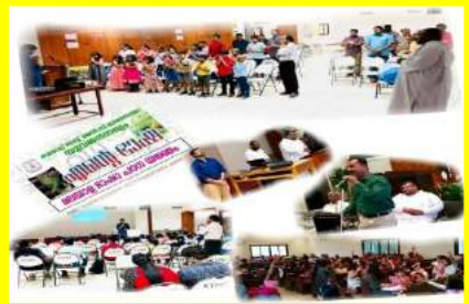
Malayalam Class organized by Yuvajana Sakhyam