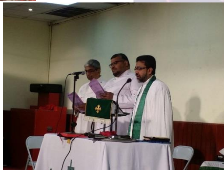
Joint Ecumenical Worship.