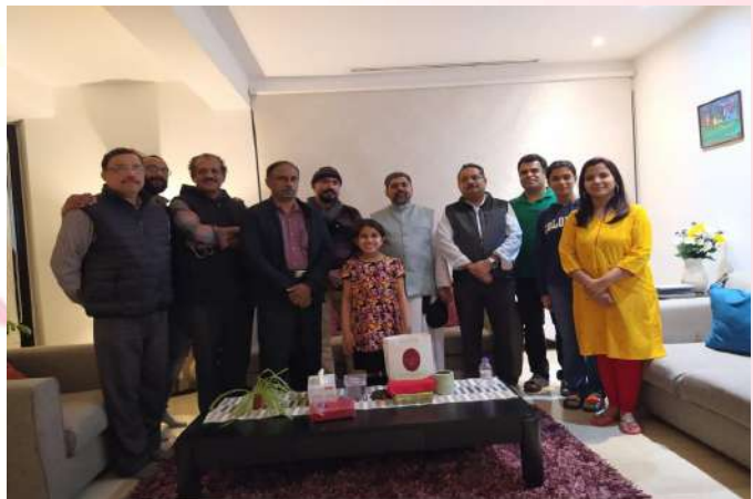
Christmas Carols Rounds House-to-House