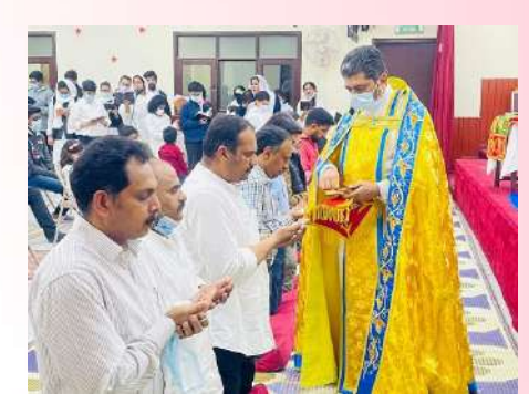
Christmas Holy Communions Service