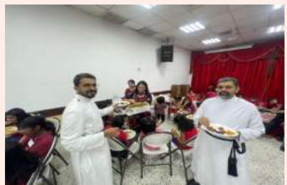
VBS – Love Feast