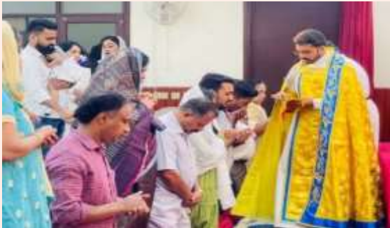
Family Dedication Day