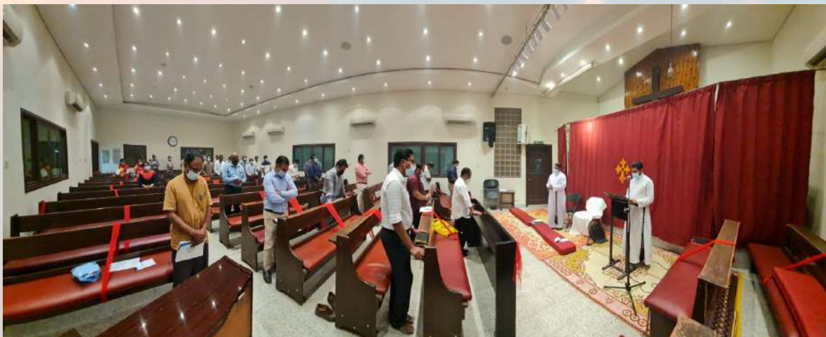
Retreat – Parish Office Bearers, Kaisthana Samithi Members, Prayer Group and Organisation Office Bearers.