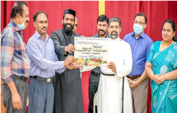
Release of Raffle Coupon