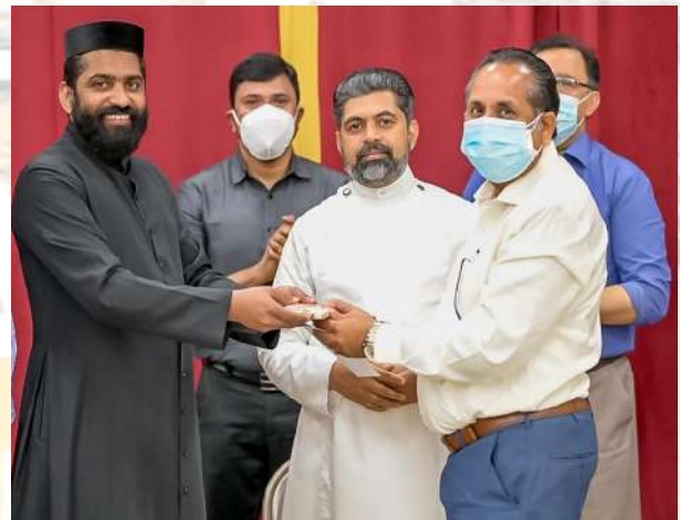
Handing over of First Raffle Coupon