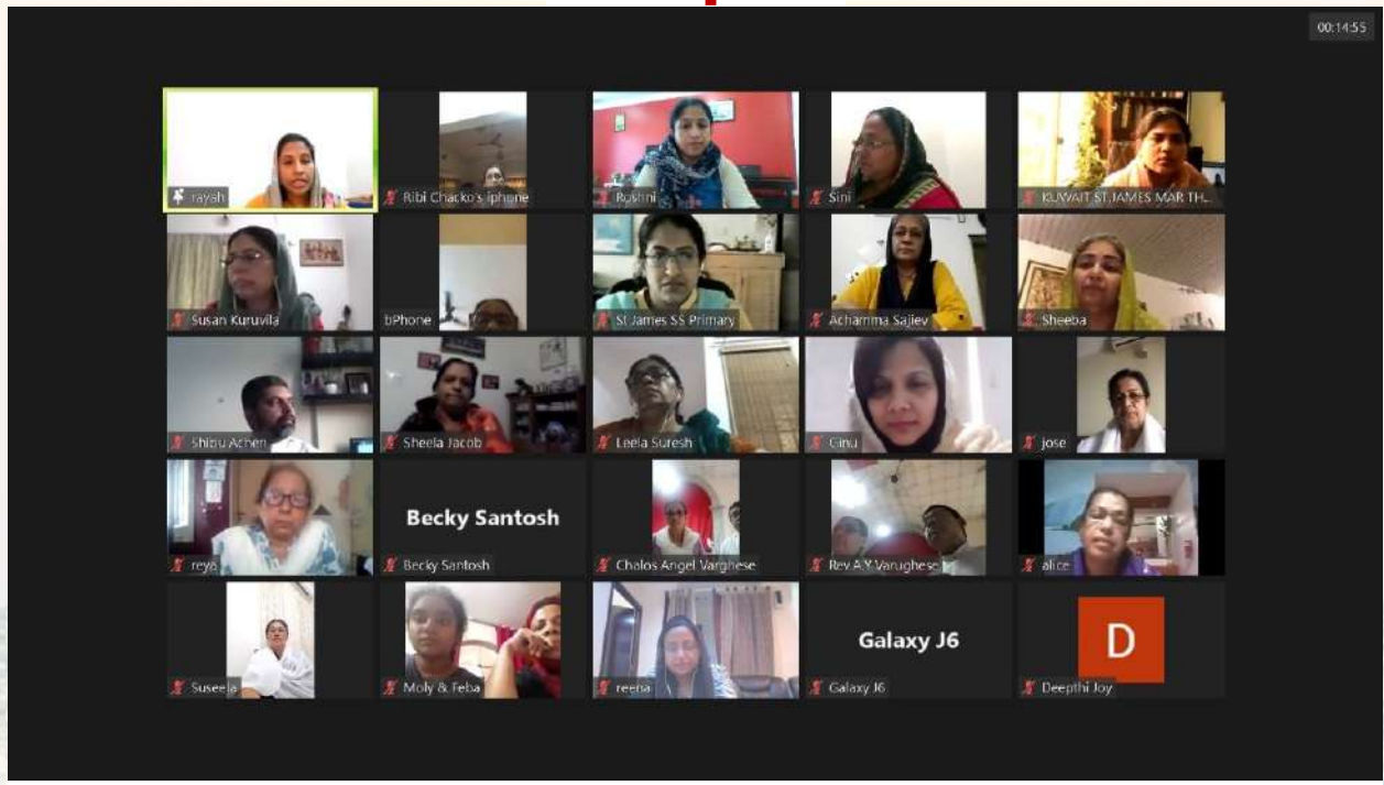
Sevika Sanghom Meeting with Ex-Members