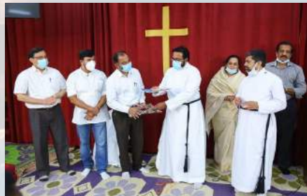
Releasing of 10 th Year Souvenir, 'Kanivu'