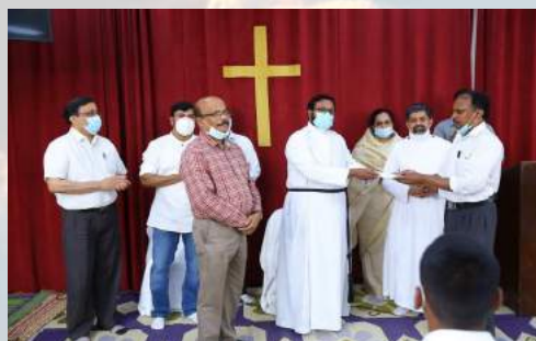
Handing over of 10 th Yr Project Fund to new Trustee