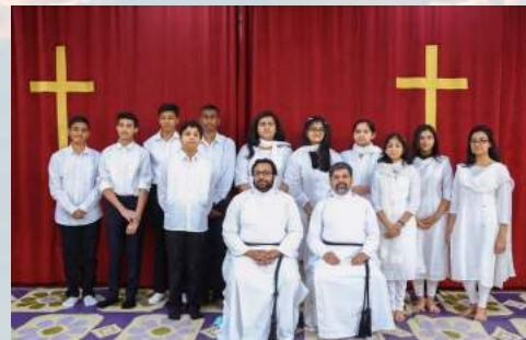
First Holy Communion