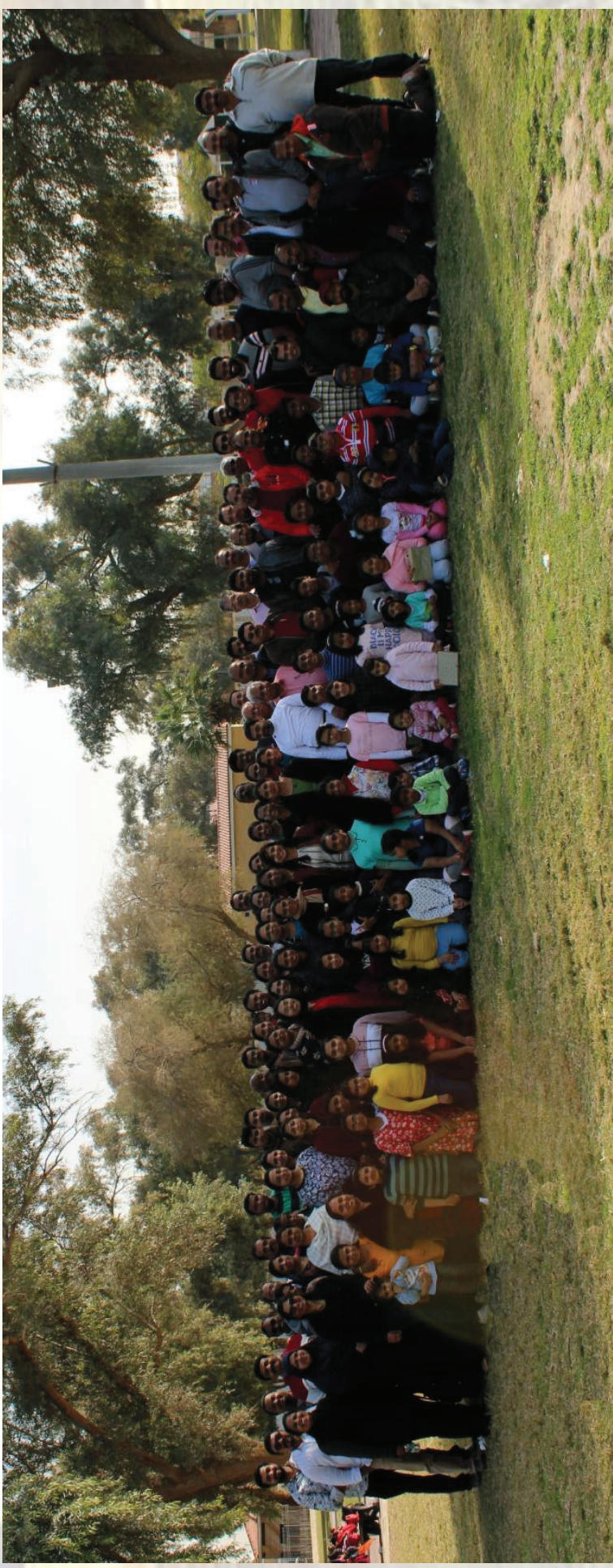
Church Annual Picnic