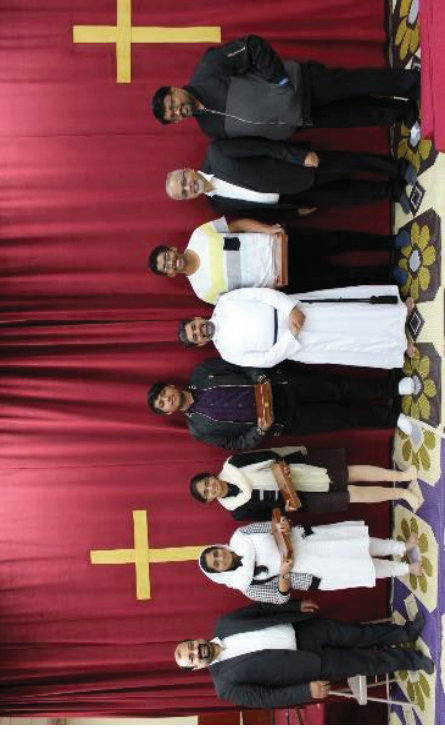
Sunday School Annual Examination Certificate Distribution